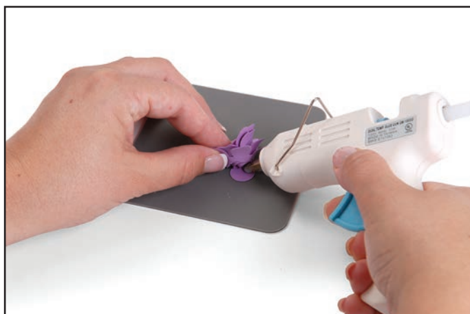
4. Adhere rolled petals to circular center piece.