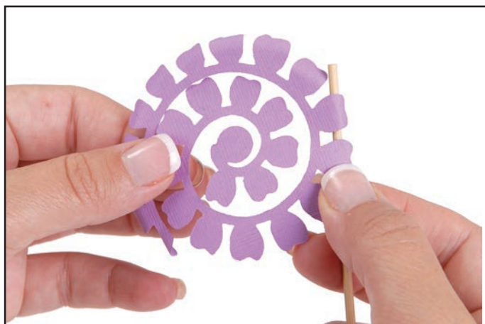
2. Add shape to petals with a small dowel or skewer.