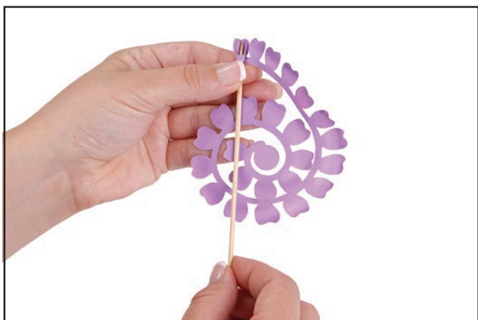
3. Begin rolling petals from outside to inside finishing at the circular base.