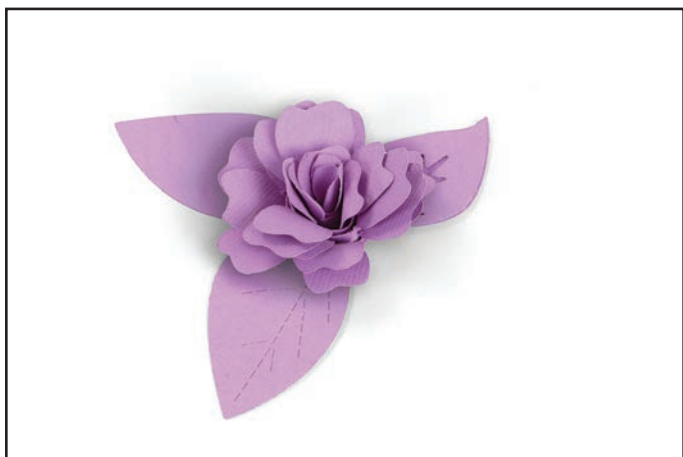
5. Arrange flower petals and leaves as desired.