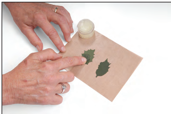
2. To create the waxy look of the Leaf, apply petroleum jelly to the side of the Leaf that will be visible, and let it absorb and dry.