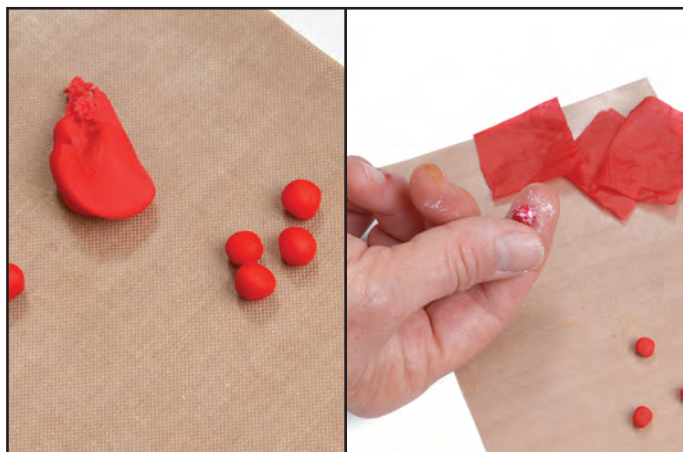
5. Create berries by using an air-dry clay (Makins®), Viva Decor Paper Pen Red, or by rolling up a 1" to 1 1/2" square of red tissue paper and glue into a ball.