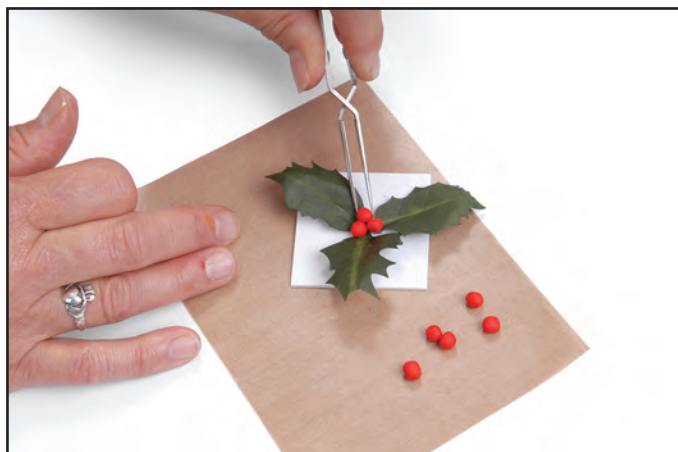
6. Set berries in the center of the Leaf clusters.