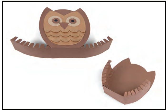
4. Adhere the tabs on the sides to the Bag front.