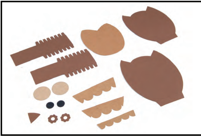
1. Die-cut pieces from desired material.