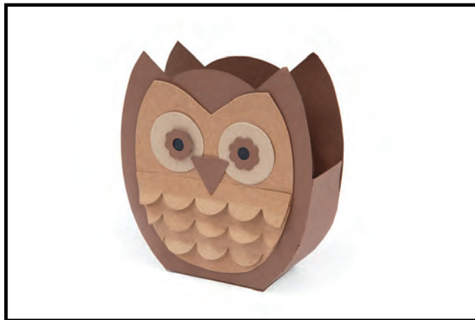
5. Adhere the Bag back to the base and sides.