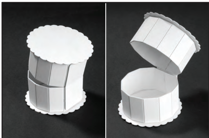
5. A double box can be created by assembling two box bodies and adhering the hinge to the outside of the double wide section as shown.