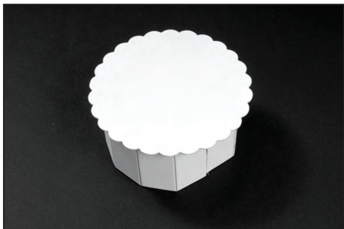
3. Adhere one of the scalloped pieces to the bottom (closed end) of the box.