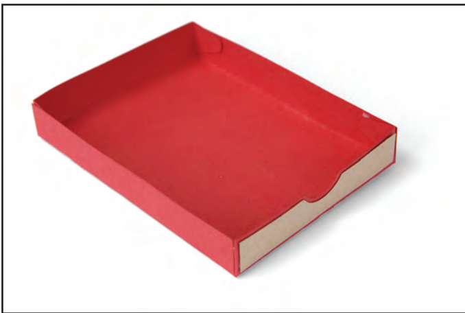
3. Construct the Drawer by adhering the triangular tabs to the inside of the side pieces.