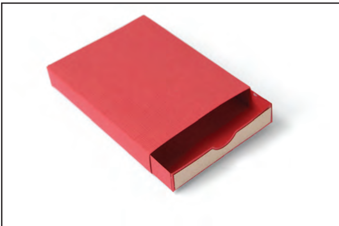
5. Slide the assembled drawer into the sleeve.