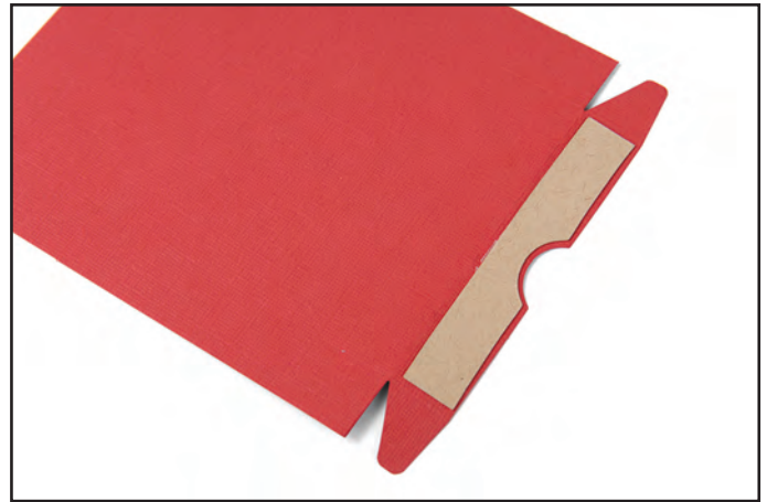
2. Adhere label to front edge of drawer.