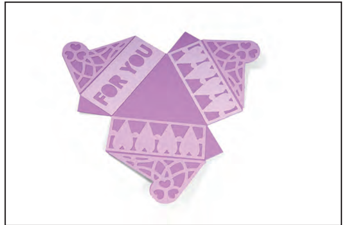
2. Embellish box body.