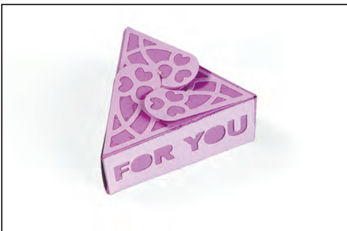
5. Slid the remaining circular tab beneath the corresponding circular tab.