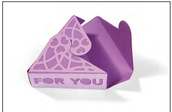
4. Close the box by folding in the side tabs and engaging two of the center tabs.