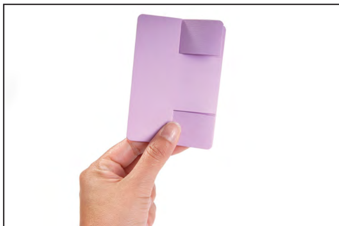
3. Once folded, the trifold mbellish as desired.