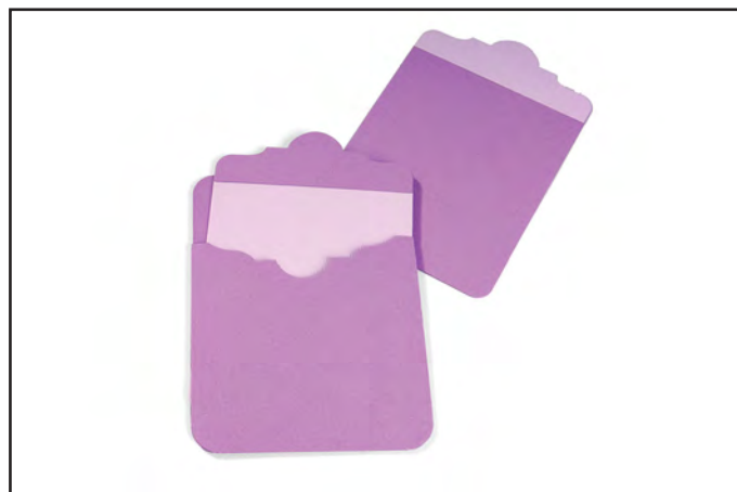
4. Embellish as desired.