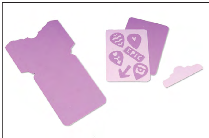
1. Die-cut from cardstock