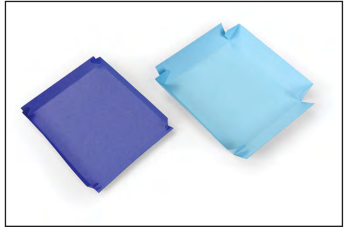
2. Fold all creases inward and adhere the side flaps to their adjoining sides.