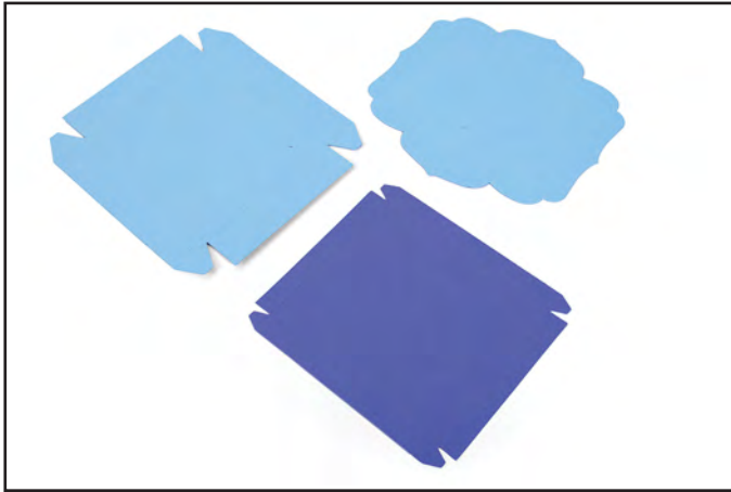
1. Die-cut Box and Lid from desired material.