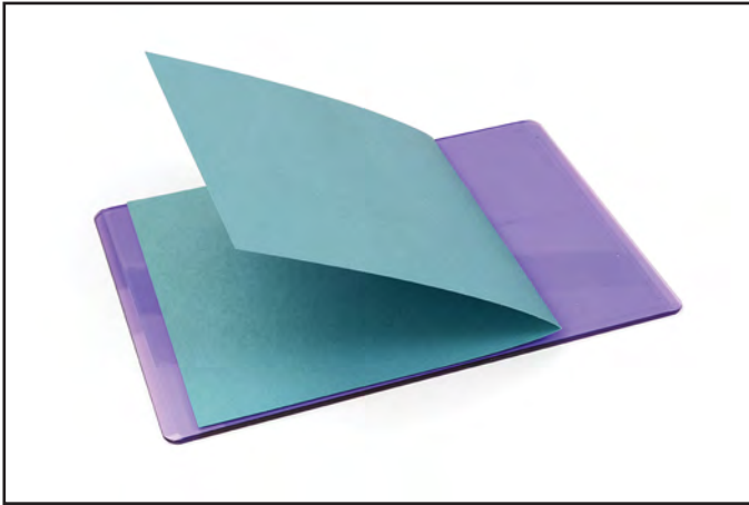
1. Fold cardstock in half and place on top of cutting pad.