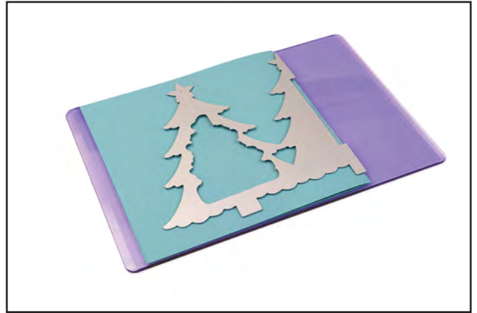
2. Align the flat edge of the die with the folded edge of the cardstock. Allow the die to slightly hang over the edge of the fold.