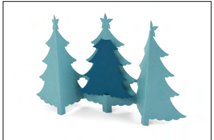
4. Insert slides into the top and bottom slits of the center tree as shown.