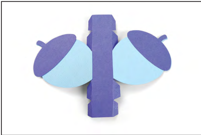
3. Adhere flat edge of Acorn sides to the largest tabs of the center strip.