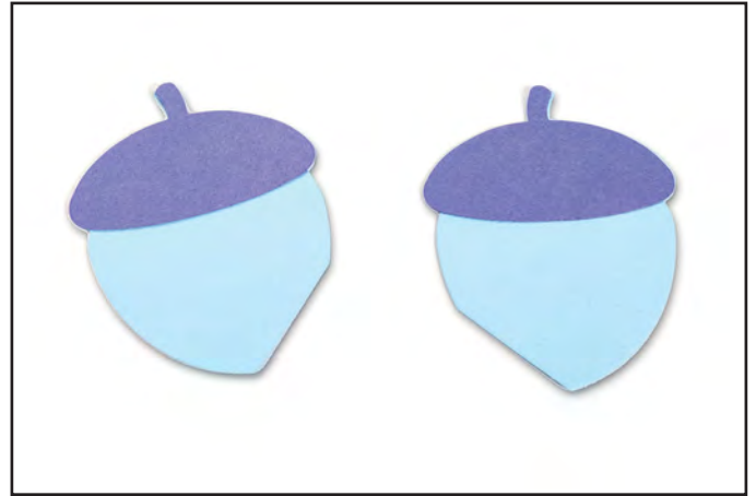
2. Adhere Acorn cap to Acorn body. Build as mirror images.