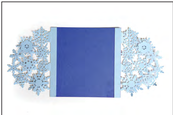
3. Adhere the Snowflake flaps to the back side of the Card body.