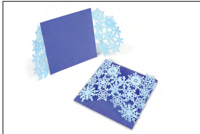
4. Fold Snowflake flaps toward the front of the card and embellish as desired.