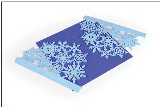
1. Die-cut two Snowflake flaps from desired material.