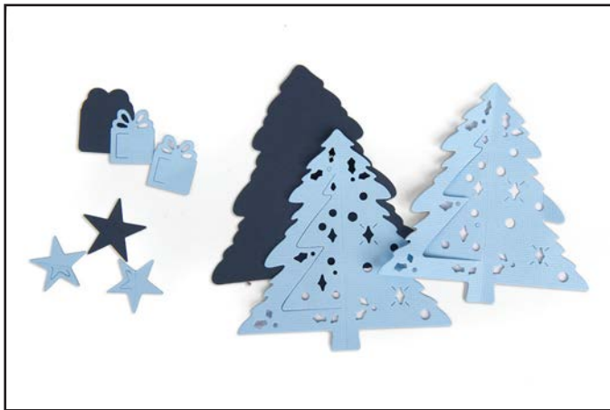
1. Die-cut two dimensional pieces and one background for each shape out of desired material.