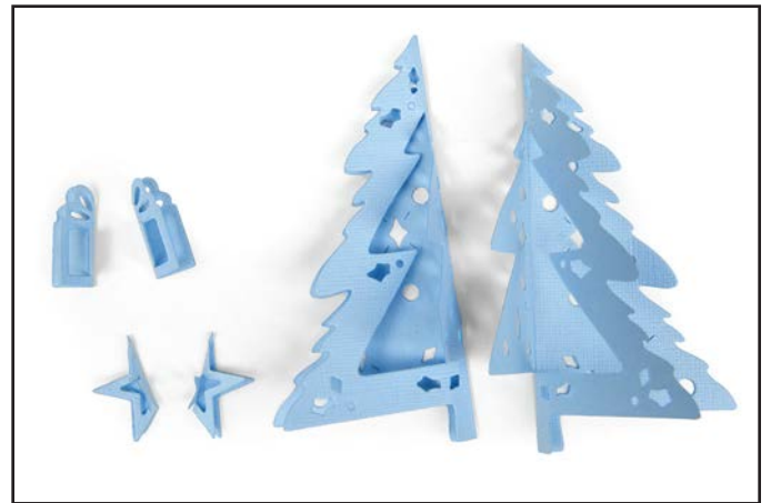
2. Fold the dimensional pieces in half.