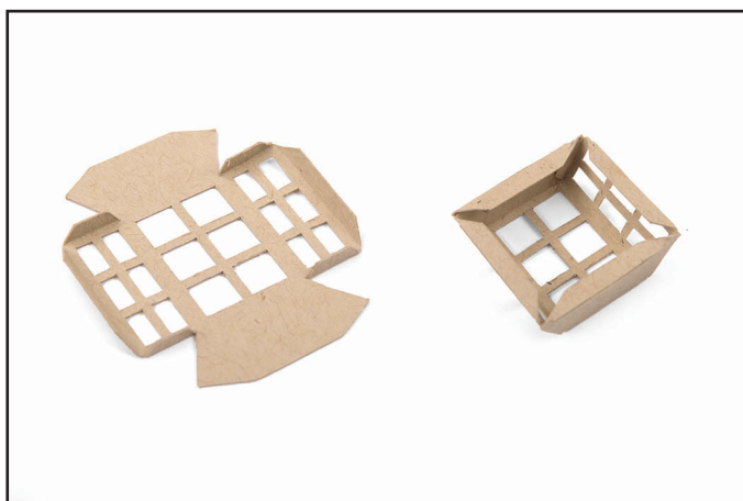
3. Fold the garden window as shown.