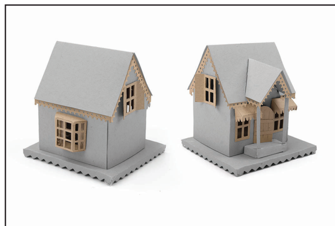
4. Apply windows, shutters, door, awnings, garden window and decorative trim to enhance or modify any of the Tim Holtz® dwellings.