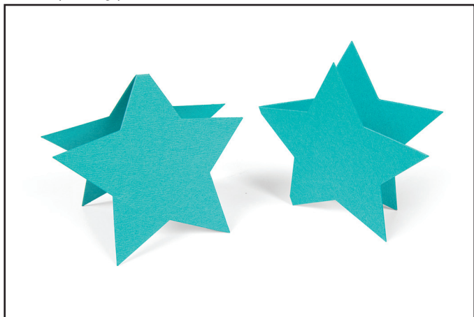
5. Place a Cutting Pad on top of the die and roll through a Sizzix® machine, using the appropriate platforms and shims for the machine. Embellish as desired.