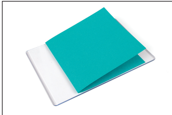
2. Place the folded cardstock on the Cutting Pad.