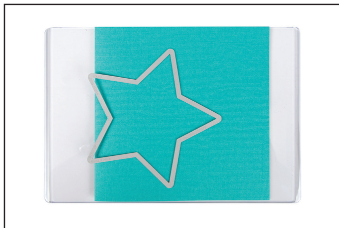
4. For a card base that hinges on the side, position the die with the cutting edge of a single point just past the edge of the fold. The words "Place fold here" are embossed into the die on the corresponding point.