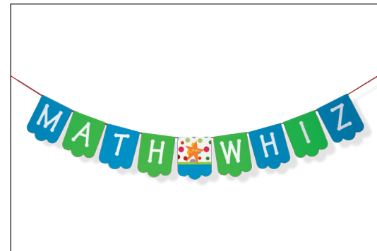
Figure D (Scallop)

The teacher will die-cut the materials for student use prior to the lesson.