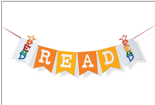
Figure C (Ribbon)